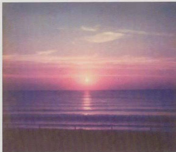
Sunrise over the beautiful Atlantic Ocean at Virginia Beach, Virginia